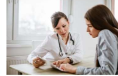
New PCN contract increases onus on GPs supervising PAs