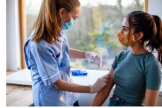
New PCN contract signals move to 'collaborative' vaccination delivery